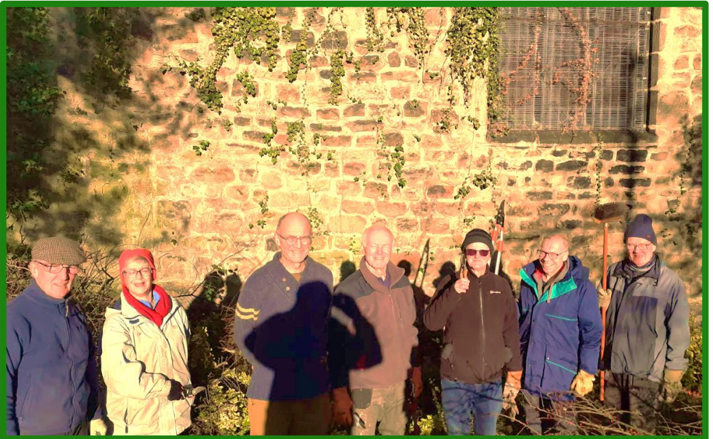
BELOW. After the pruning was finished