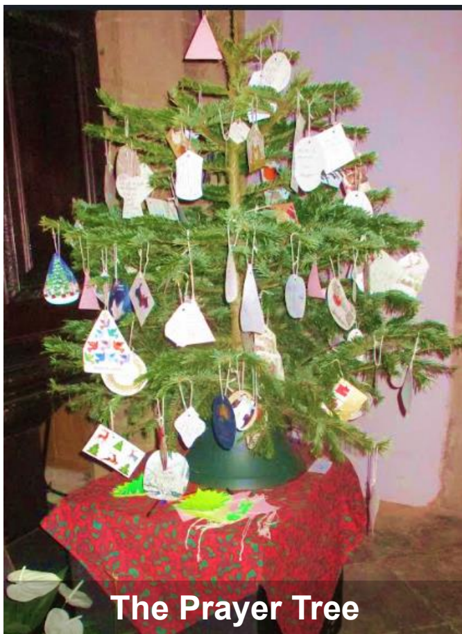
The Prayer Tree

One of the most notable features of the festival is the number of visitors it brings into the Church. We gave out over 1,000 programmes, many of which were shared by couples or families. In addition to these visitors, children from all the schools in Otley came and sang, including all the children and all the staff from St Joseph's. It was especially pleasing that the Christmas Tree Carol Service was very well attended including many people from the charities with their families. Perhaps even more pleasing were the many positive comments about the service and what it had meant to the people who came.