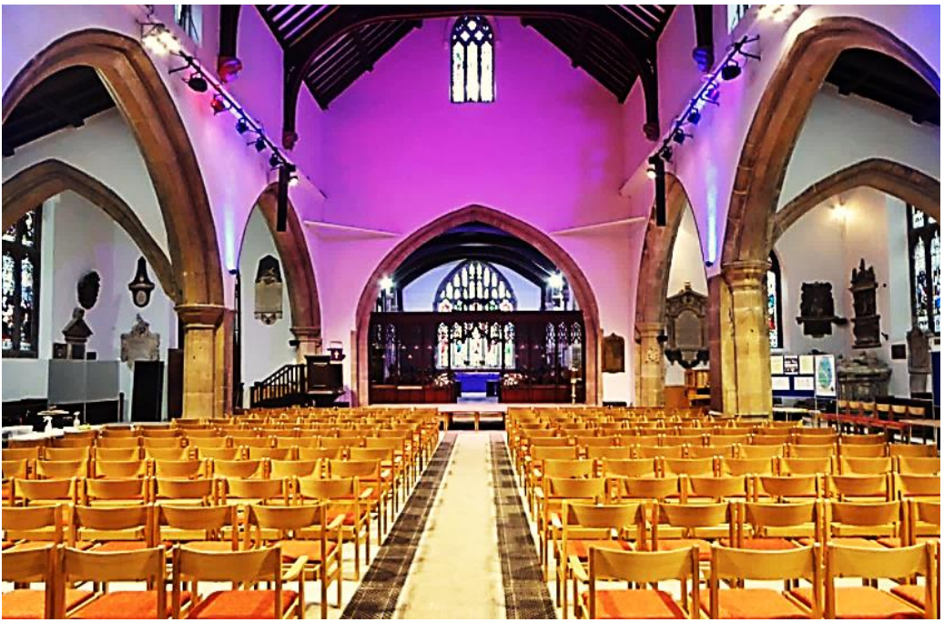
Otley Parish Church